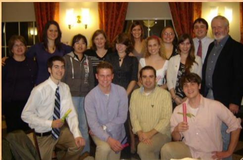
Nu Rho Psi annual induction ceremony at Miami University