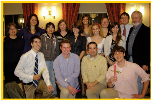
Nu Rho Psi annual induction ceremony at Miami University

More detailed information and applications can be found on the Nu Rho Psi website at: www.nurhopsi.org/drupal/apply